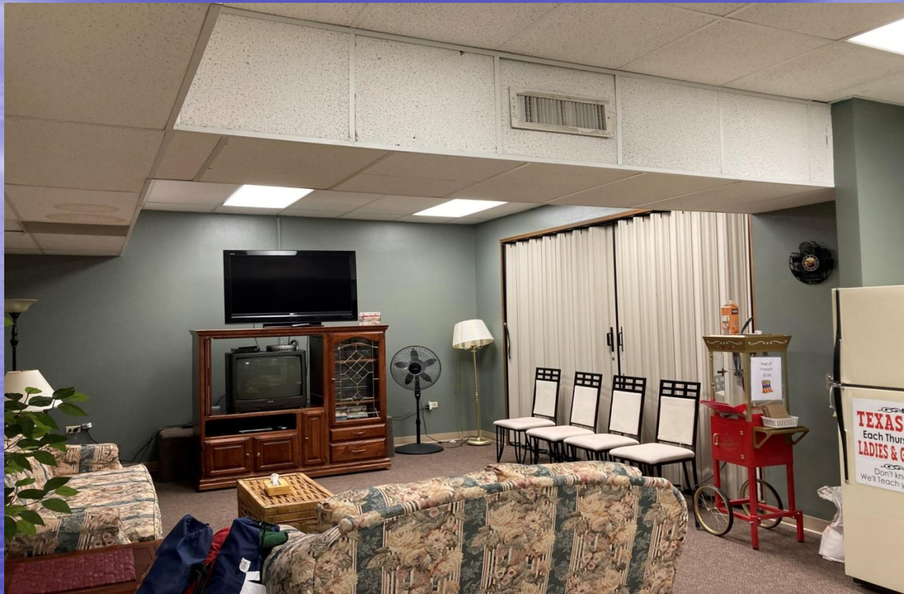
Living Room/TV Room seats approximately 12 persons