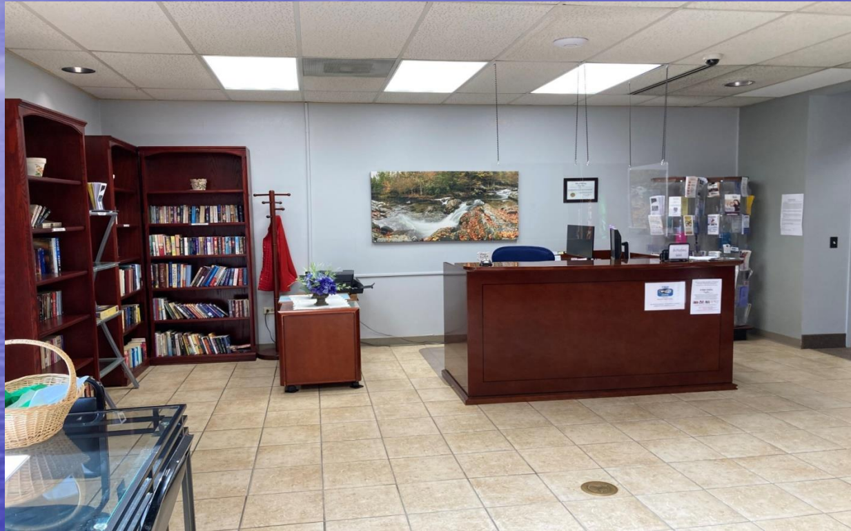
Lobby / Reception area is small, including donation library